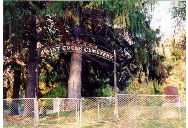
Formal entrance to Paint Creek Cemetery on Orion Road, an original burying ground established by early settlers in 1832. The Cemetery Association has continuously met to this day on the grounds.

On Wed. November 7 the Society hosts Building on Faith , Detroit's famous his-